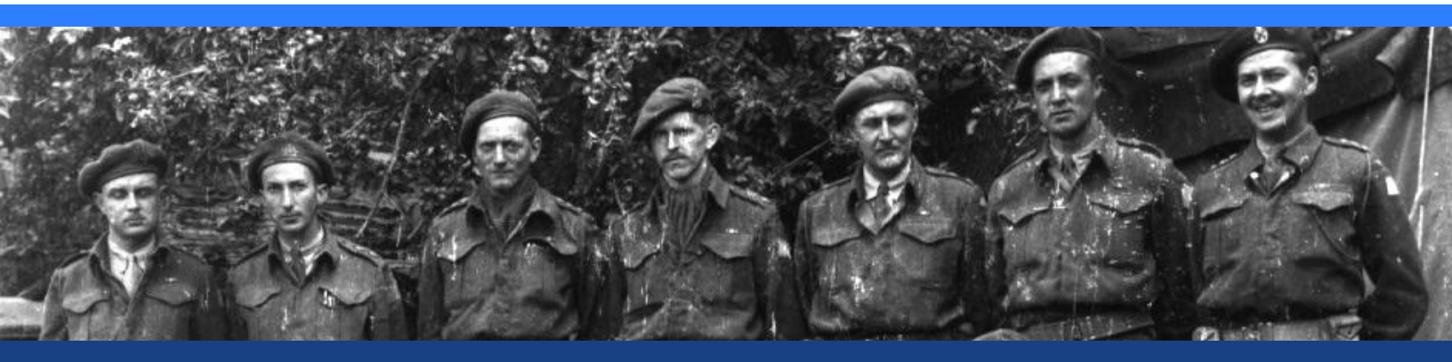
4. How many Canadian Ordnance Corps workshothe RGEME Foundation c E-News | page 2