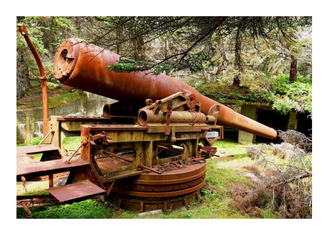
Abandonned 10 inch gun in Shelburne NS (in bad need of maintenance!)