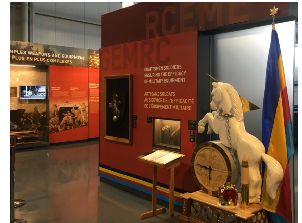
The RCCEM Museum, Kingston, Ontario

Copyright © 2021 The RCCEM Heritage and Museum Foundation, All rights reserved. Printed April 2022