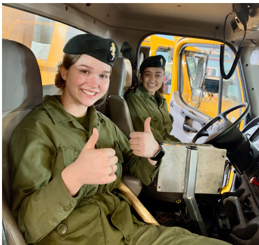
RCME Army Cadets, Lower Sackville, NS