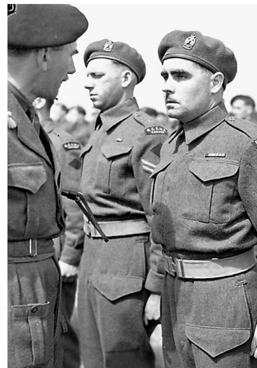
RCME on Parade, UK, circa 1944

Email: info@rcmefoundation.org Web: https://rcmefoundation.org Address: RCME Foundation Secretary 13 Wintergreen Dr. Stittsville, ON, K2S 1E5